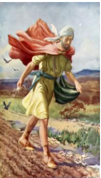
15 th Sunday of the Year

SACRAMENT OF RECONCILIATION: while social distancing remains mandated persons wanting (needing) Confession should call the rectory (570-822-893). Confessions by appointment only.